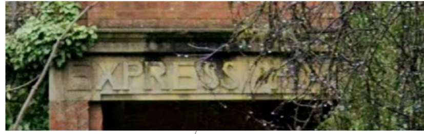
Express hall sign to be placed centrally within stone wall