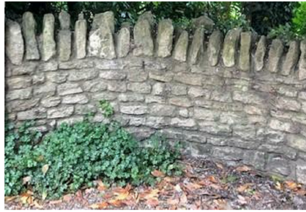
Boundary to frontage to be 600mm Stone wall. Reclaimed materials to be used from existing wall where possible